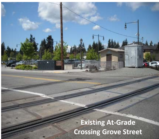
Existing At-Grade Crossing Grove Street

The Grove Street Overcrossing project proposes to construct an overcrossing that would span the BNSF Railway track. The overcrossing bridge would be about 67 feet wide and 120 feet long. The location along Grove Street is ideal because it has the least impact on adjacent property and also provides the longest distance between arterial streets, Cedar Avenue and State Avenue.